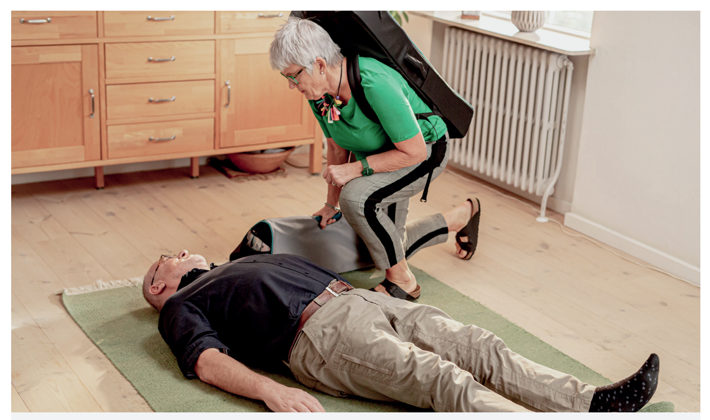
If you have an accident and fall at home, help is on hand with Raizer M. A relative can help a fallen person gently back up - without waiting for and ambulance or other outside help.