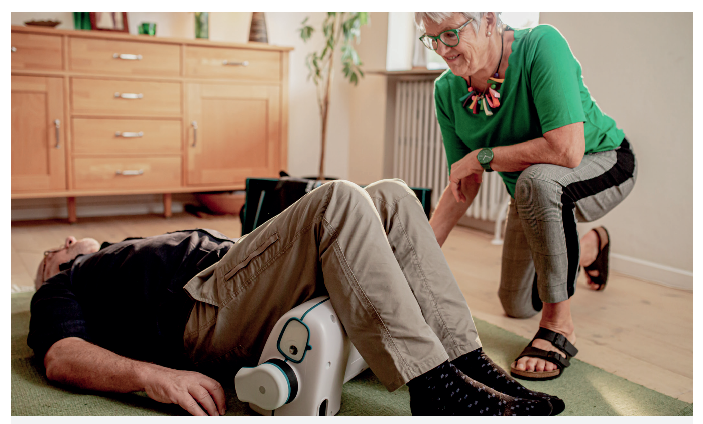
For a relative, it is easy to help the fallen person back to their feet. The Raizer M is simply assembled under the lying person and driven up using the crank handle. It takes no effort to operate and the chair rises at a pace convenient for both.